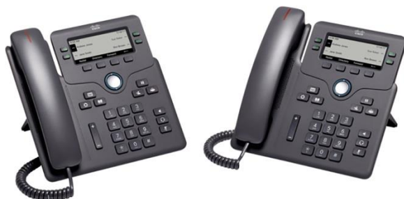
Figure 1. Cisco IP Phone 6800 Series: 6841 (left) and 6851 (right)

The line keys on each model are fully programmable. You can set up keys to support either lines, such as directory numbers, or call features, such as speed dialing. You can also boost productivity by handling multiple calls for each directory number, using the multiple-calls-per-line appearance feature. Tricolor LEDs on the line keys support this feature and make the phone simpler to use.